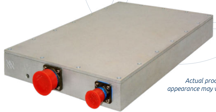
Actual product appearance may vary.