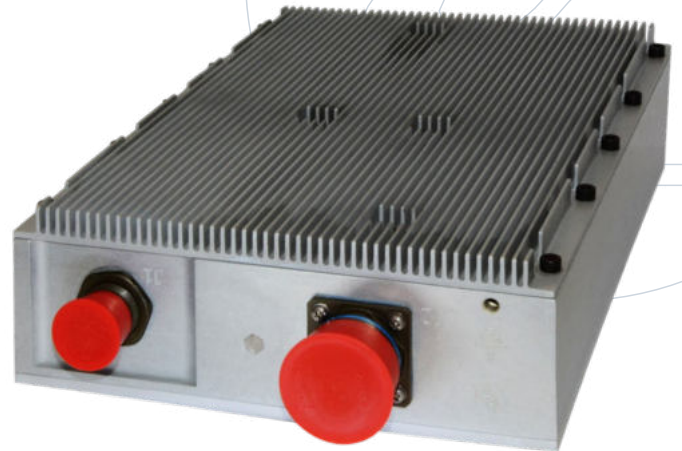
Actual product appearance may vary.