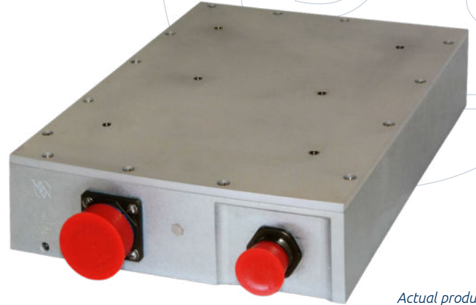
Actual product appearance may vary.